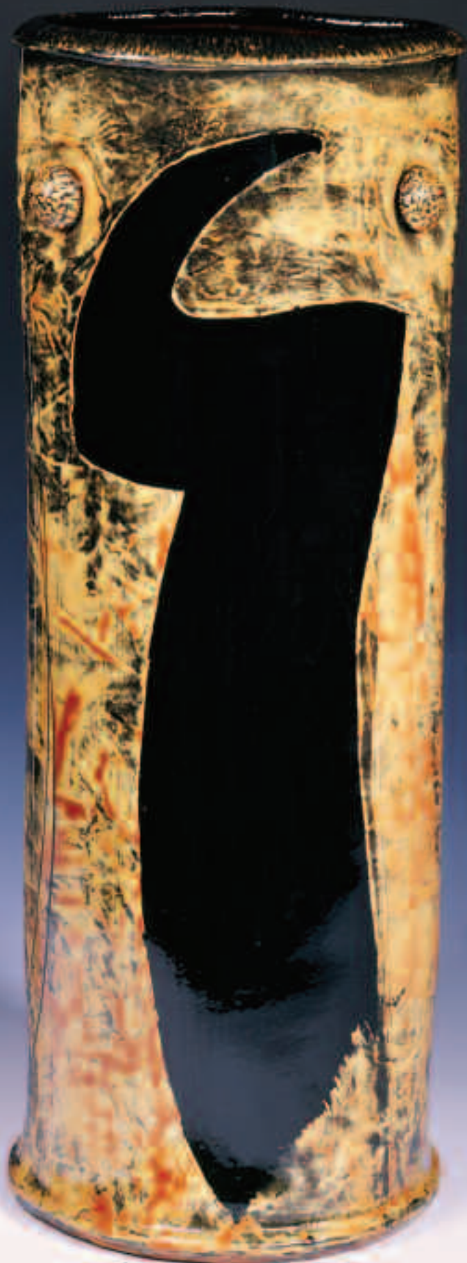
Right: Vase . 2005. Slipware. 66 x 27cm.

English buyers respond enthusiastically to the scale of her work, its simple lines and layered autumnal colour. The black slip, poured or sprayed, remains a strong feature of the forms; sometimes it is a background colour, hovering