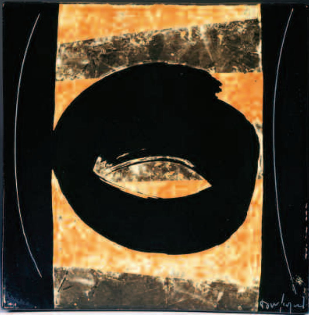
Landscape Dish. 2005. Slipware. 65 x 65 cm.

shadow-like behind warm ochres or grey-blues and at other times it becomes more prominent and bold. Paper or wax resist methods are frequently used and areas of softer colour are textured with newspaper. The design is typically brought into focus with energetically scored lines that are sometimes filled with white or blue. The large dishes are dramatic; objects that create a focal point in space.